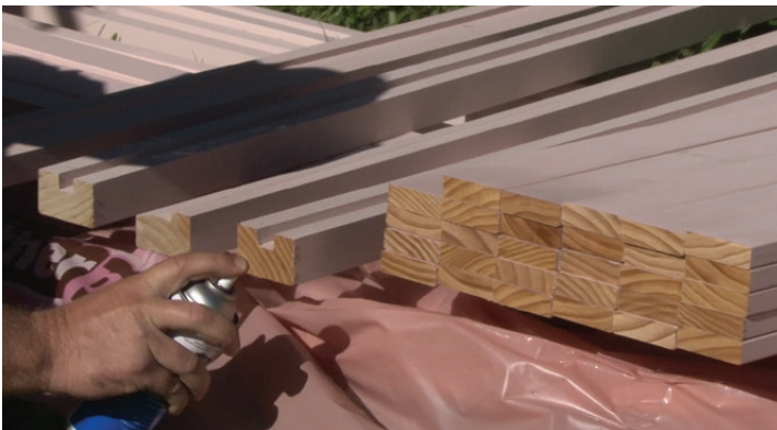
Photo 1: Avoid premature failure by applying a brush on or spray on supplementary preservative to all cut ends, holes, notches etc.

This data sheet provides information and advice aimed at improving and ensuring the in-service performance of these products such as beams, cladding, hand rails, posts, newels, mouldings, decking etc. These products may include solid timber, laminated & finger jointed timbers and LVL.