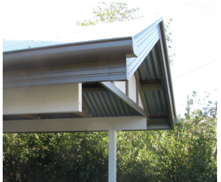
Photo 4: Adequate overhang and quality pale coloured paint system provide good protection to end grain and sun exposure.

Apply two topcoats of either quality acrylic or solvent based paint to the prepared product. In harsher environments high gloss paints are recommended.