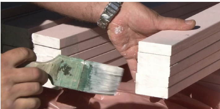
Photo 2: Also apply oil-based alkyd primer over supplementary preservative applied to all cut ends, holes, notches etc